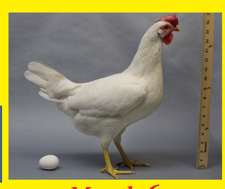
Month 6 Hen is fully grown and starts to lay eggs.