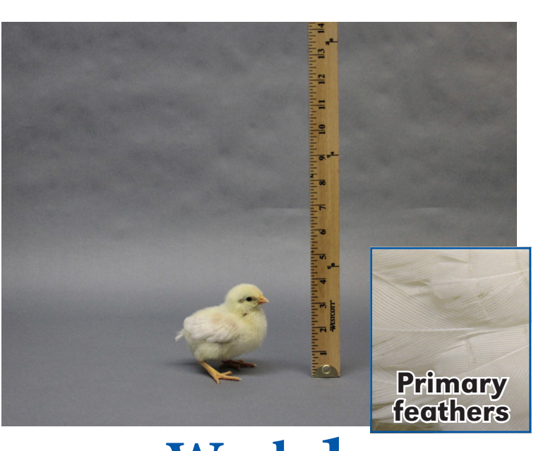
Week 1 Around 3 days, chicks start growing feathers called primary feathers on their wings.