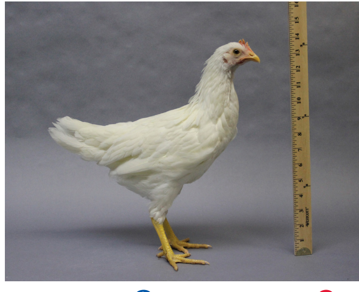
Week 8 / Month 2 Males start learning to crow.