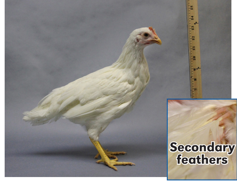
Week 9 Secondary feathers start replacing primary feathers.