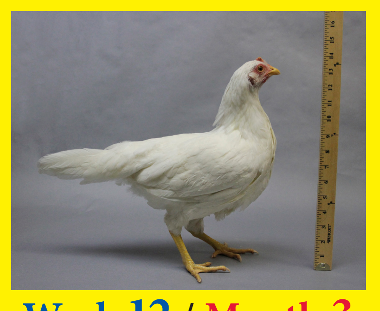
Week 12 / Month 3