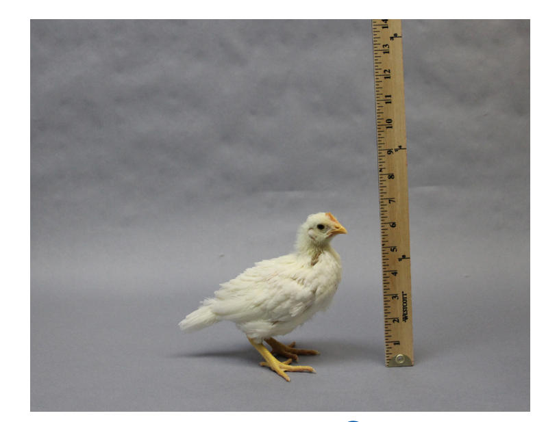
Week 3 The body is fully covered by feathers.