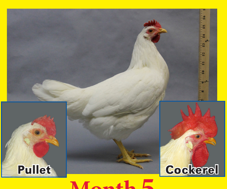
Month 5 Pullets combs start to get larger and turn red (some flop over).