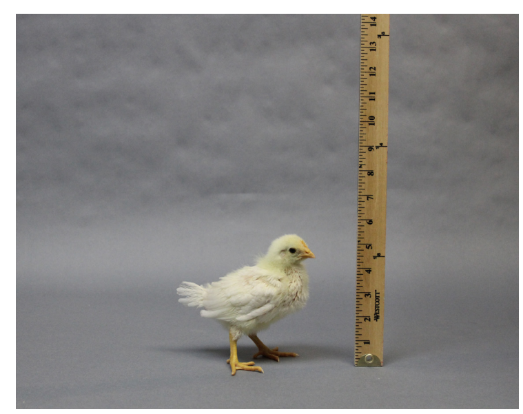
Week 2 Primary feathers start growing on their body and tail.